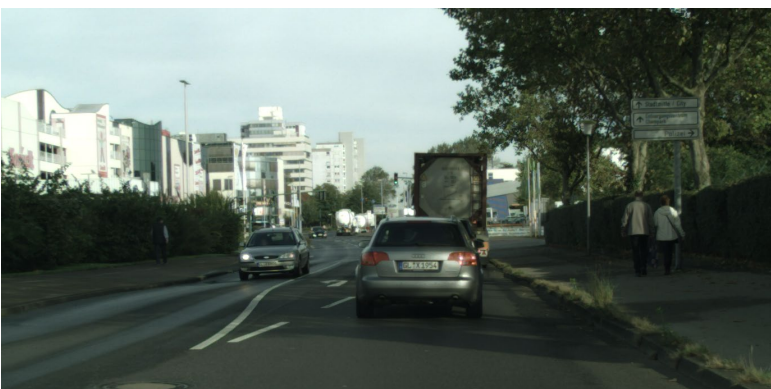
(e) Input Image