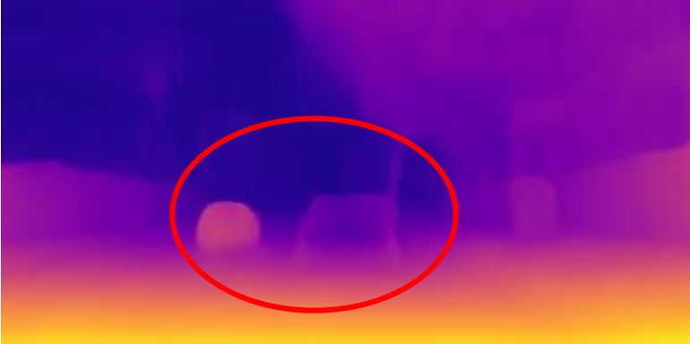
(a) ManyDepth [2]