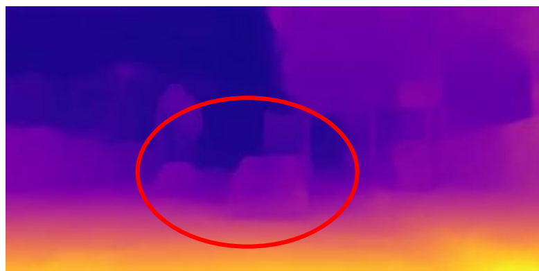
(d) DualRefine [3] + Our MAL