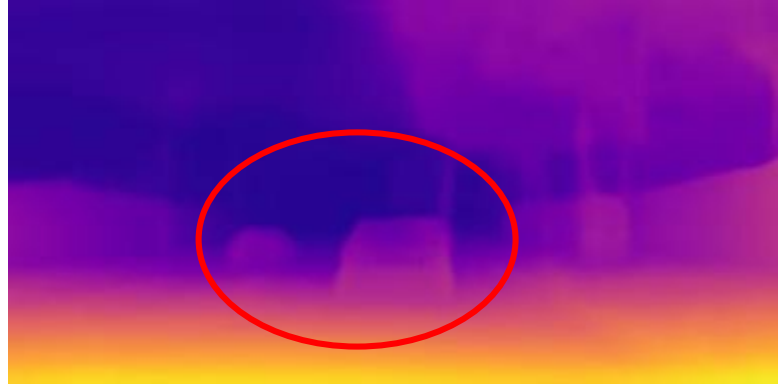
(b) ManyDepth [2] + Our MAL